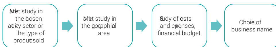
Figure 2. Company creation process suggested by the Direction of Legal and Administrative Information of France

The French government, through the Direction of Legal and Administrative Information (2018), indicates a similar process to open a business, this process is shown in Figure 2: